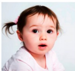
Baby / Child

For product queries, please read our FAQs listed below. For health and safety reasons, we cannot accept half used, old products. Please only donate what you would consider happily gifting a friend.