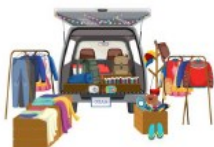
Table Top & Car Boot Sale

All proceeds towards 'Save Our Allotment' Fund